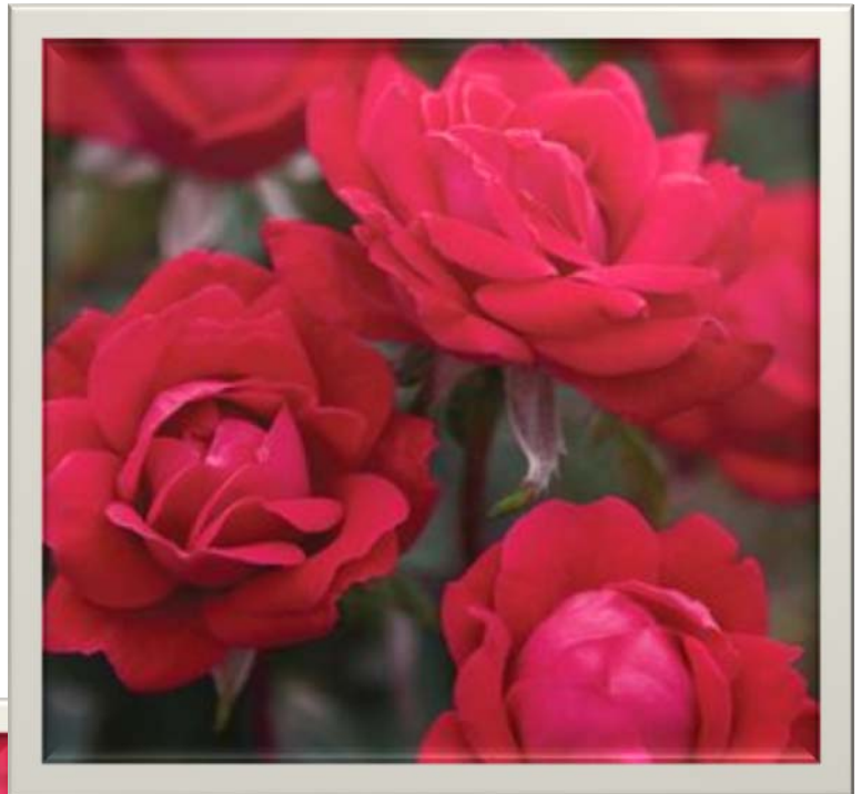
Double Knock Out Rose